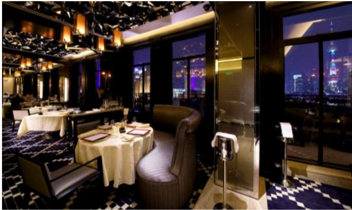
8 ½ Otto e Mezzo BOMBANA Shanghai